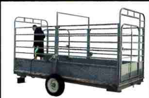
Group Livestock Scales