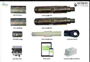
Grain Cart Scales