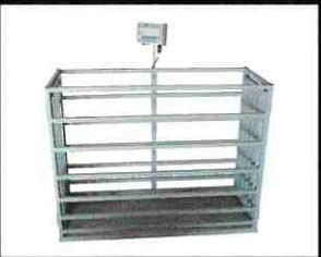
Small Animal Scales