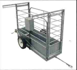
Individual Animal Scales