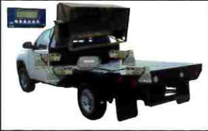
Cake Feeder Scales